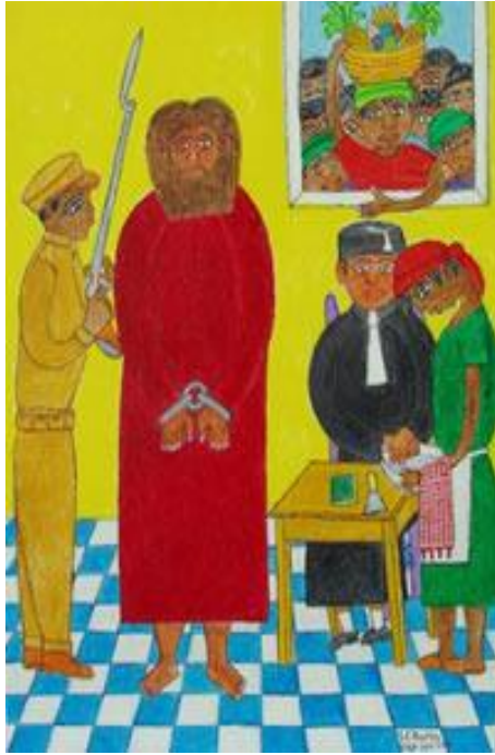
Jesus before Pilate, Seymour E. Bottex, Haiti.