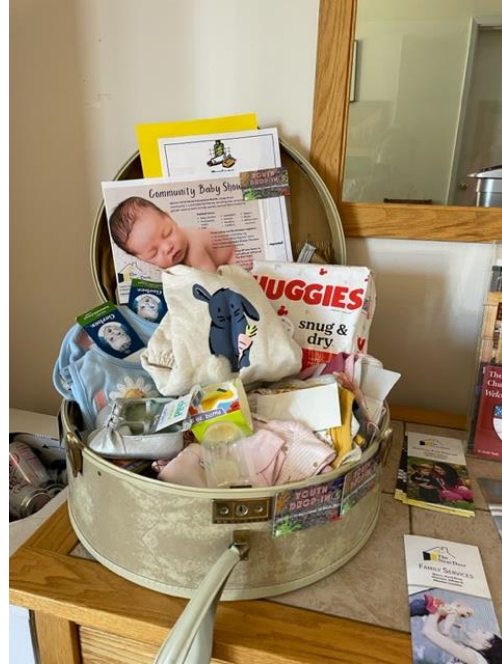
Contributions from St. Paul's to The Next Door include these items as well as two huge bags of supplies and toys for babies. Special thanks to Carole Fisher's daughter