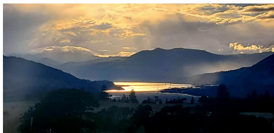
Beauty in the Columbia River Gorge

What's the endgame for the Covid virus? Tap on this blue box to find out. Atlantic magazine article submitted by Chuck Miller.