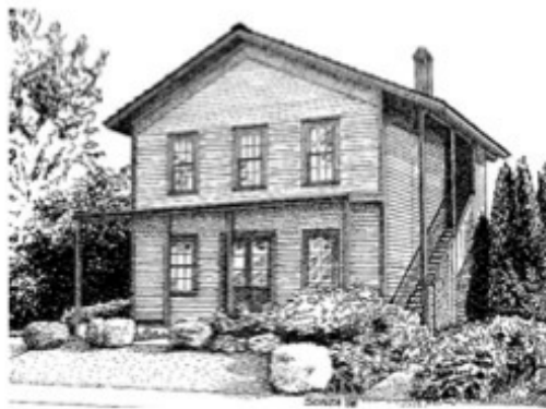
ORIGINAL WASCO COUNTY COURTHOUSE - 1859